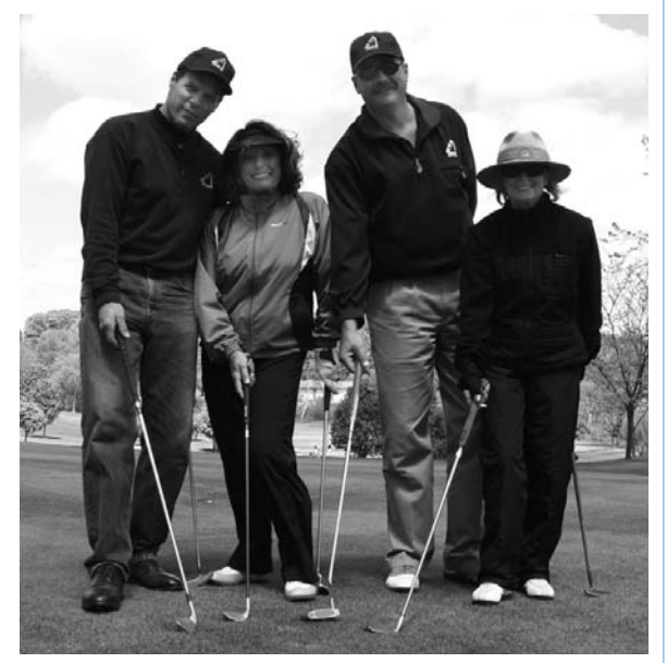
Meyer Contracting Corp. foursome.

This event was a success due to the support of our cochairs, sponsors, donors, participants, and volunteers.