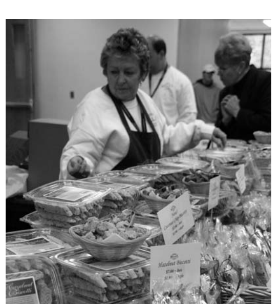
Bella's Baked Goods

If you are interested in receiving more information, donating an item, or placing an ad in the auction journal, please contact Diana Pollard at pollard@sunydutchess.edu, call (845) 431-8403, or visit our website at www.sunydutchess.edu and click on Foundation/alumni.