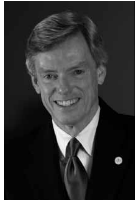
Dr. D. David Conklin

P.S. On-campus student housing will be available at DCC beginning in fall 2012! The residence hall – which features suite-style accommodations and the latest amenities for safety and comfort – will provide a wonderful option for students interested in combining the benefits of a DCC education with the experience of living away at college. Stay tuned for details!