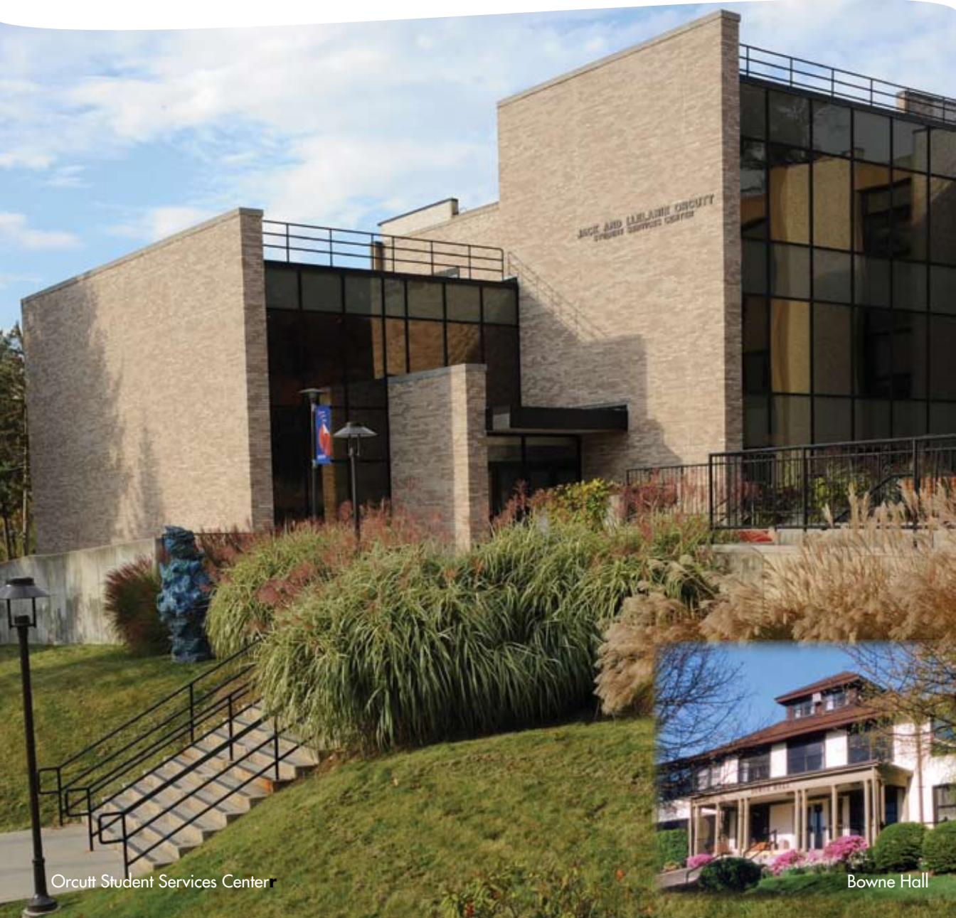
Orcutt Student Services Center

www.sunydutchess.edu MAIN CAMPUS (845) 431-8000 DUTCHESS SOUTH (845) 298-0755