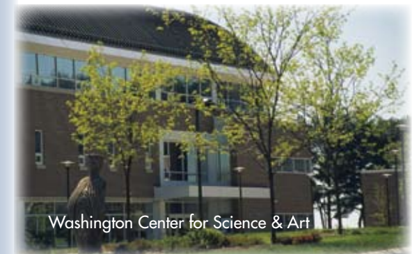
Washington Center for Science & Art

DUTCHESS SOUTH HOLLOWBROOK OFFICE PARK BUILDING #4 31 MARSHALL ROAD WAPPINGERS FALLS, NY 12590